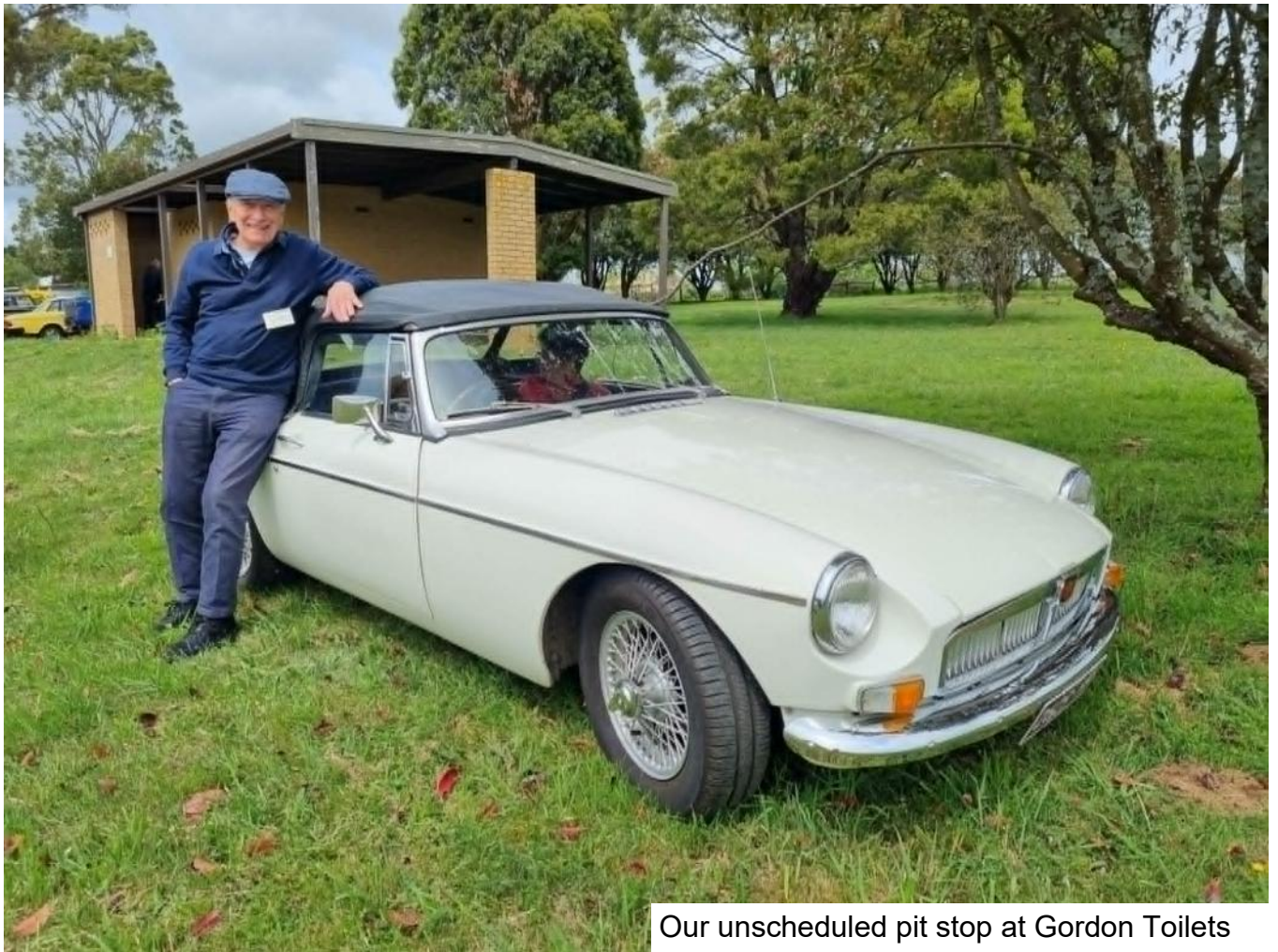
Our unscheduled pit stop at Gordon Toilets