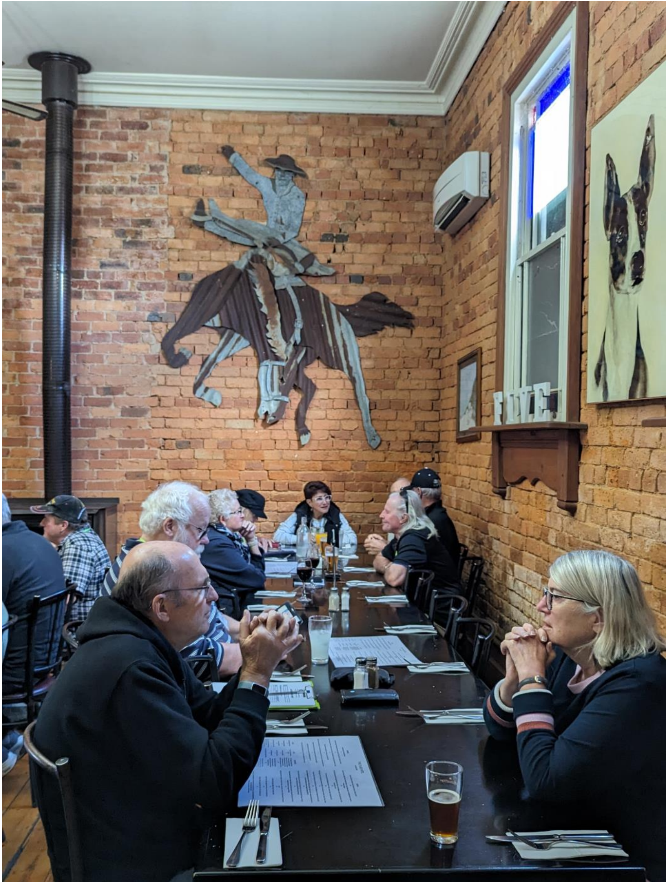
Catching up with friends while ordering and waiting for the meals to be served. Stunning décor in the Five Flags Hotel.