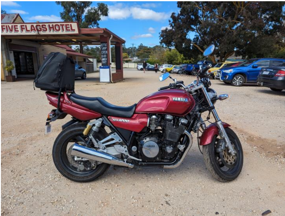
CRD Managed to fill up the carpark at the Five Flags Hotel